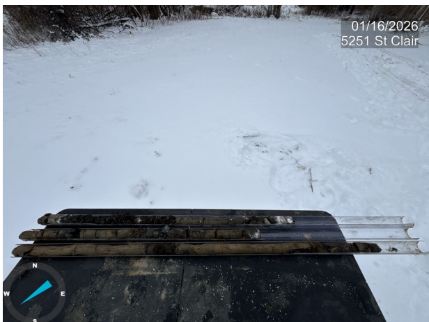
Photo 5: Viewing soil recovery from 5251 SB-01, SB-02, and SB-03 (back to front), facing southwest.