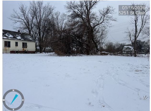
Photo 2: View of the Site surroundings pre-drilling, facing south.